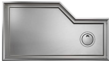
Sink Diade 3028 000